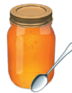
20 ml (4 tsp) honey