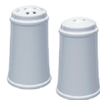
Salt and pepper to taste