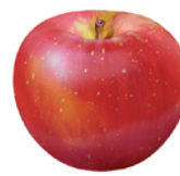
1 apple, cut into julienne strips