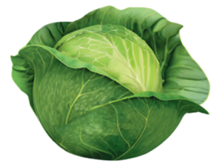
½ medium-size green cabbage, coarsely chopped

Illustrations © Québec Amérique. All rights reserved (ikonet.com)