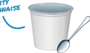
30 ml (2 tbsp) plain yogurt