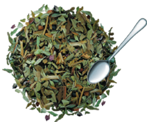
1 ml (¼ tsp) dried basil