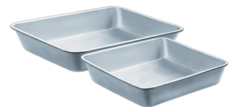
Baking dishes (8-inch square and rectangular)