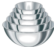
Set of mixing bowls