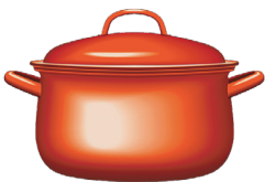
Large pot (with a lid)