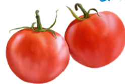
2 tomatoes , diced

THIS RECIPE CAN BE PREPARED WITHOUT TOMATOES OR WITH A HALF A CAN OF DICED TOMATOES, DRAINED.