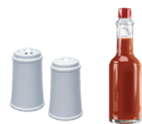
Salt, pepper and Tabasco-style hot sauce , to taste

Illustrations © Québec Amérique. All rights reserved (ikonet.com)