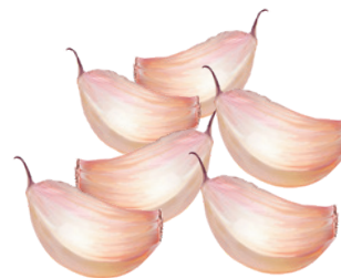
6 garlic cloves, peeled and minced