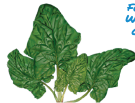
6 frozen spinach nuggets, thawed and drained (about 250 ml/1 cup) Thaw

THIS RECIPE CAN BE PREPARED WITHOUT TOMATOES OR WITH A HALF A CAN OF DICED TOMATOES, DRAINED.