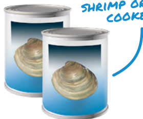
2 cans (142 g) clams

THAW IN THE MICROWAVE FOR 1 MINUTE AND PRESS WITH A FORK TO GET RID OF THE EXCESS WATER.