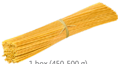
1 box (450-500 g) uncooked spaghetti